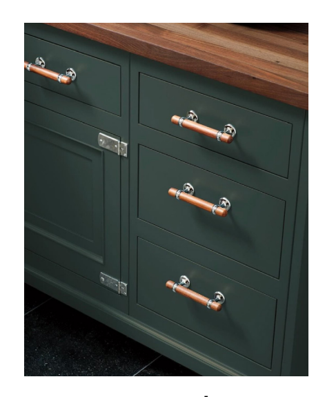
Waterworks @wtrwrks waterworks.com/us_en/