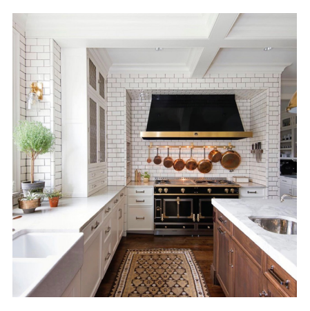
KitchenLab Interiors @kitchenlabinteriors kitchenlabinteriors.com