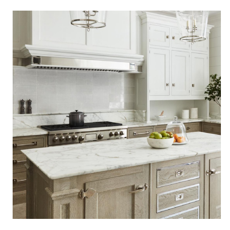
O'Brien Harris @obrienharriscabinetry obrienharris.com